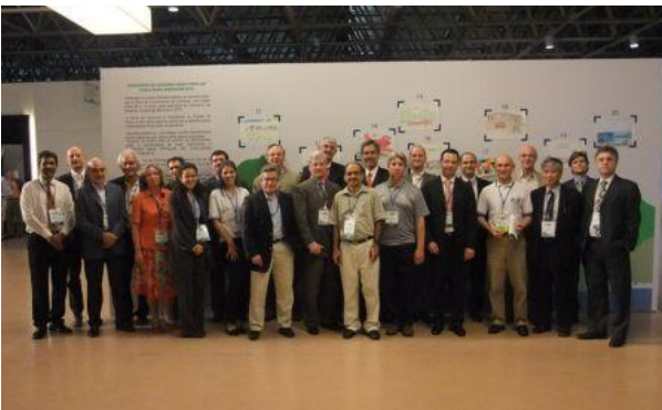
Participants of Round Table "ITS for Urban Mobility"

To read the Round Table conclusions click here